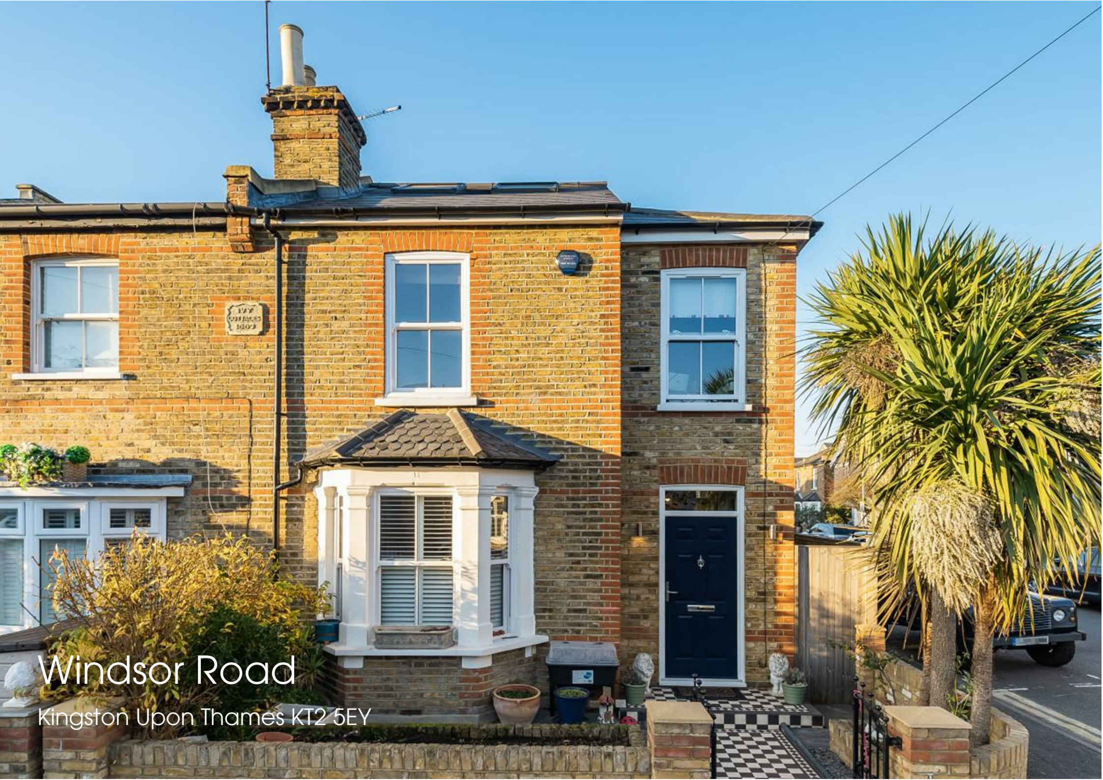
Windsor Road Kingston Upon Thames KT2 5EY